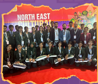
INDIA INTERNATIONAL SCIENCE FESTIVAL ( IISF 2024) 3RD PRIZE ( NATIONAL ) Quiz Competition, IIT Guwahati